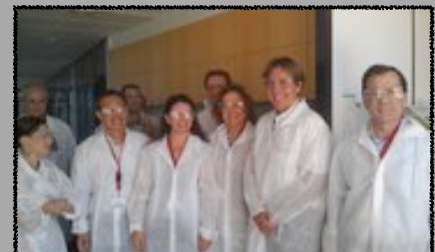
PRESS COVERAGE OF 2013 EDITION Union Tribune articles covering our First Edition of the Trade Delegation. ARTICLE 1 ARTICLE 2