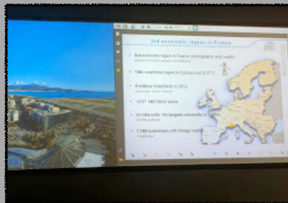
2013 PHOTOS Album from our First Edition of the Trade Delegation. CLICK HERE